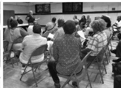
NYMAPU joins with Harlem community activists in a march and public meeting to defend College Station.